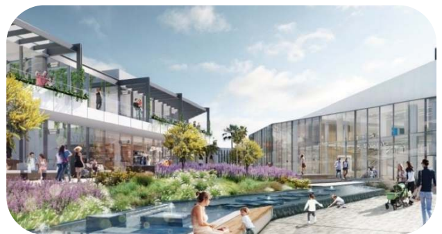
River West photorealistic views