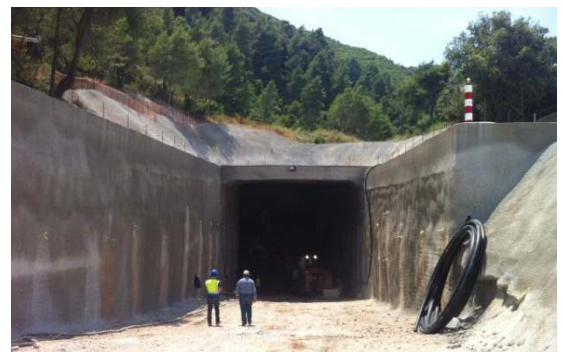
Access tunnel of Panagopoula railway tunnel