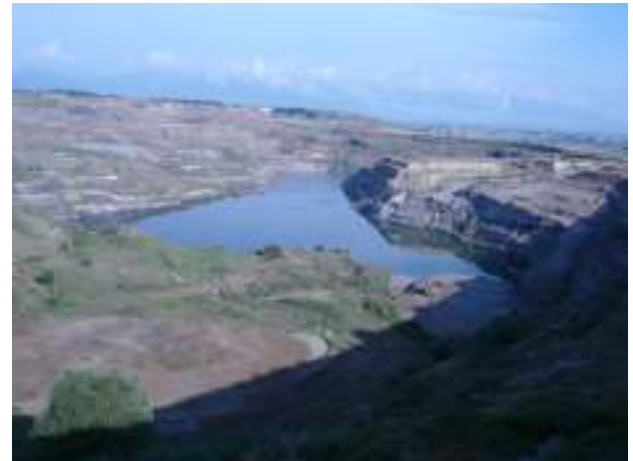
Current view of Vevi lignite mine