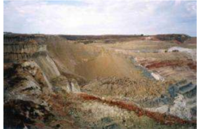
Landslide in Aggeria open pit mine