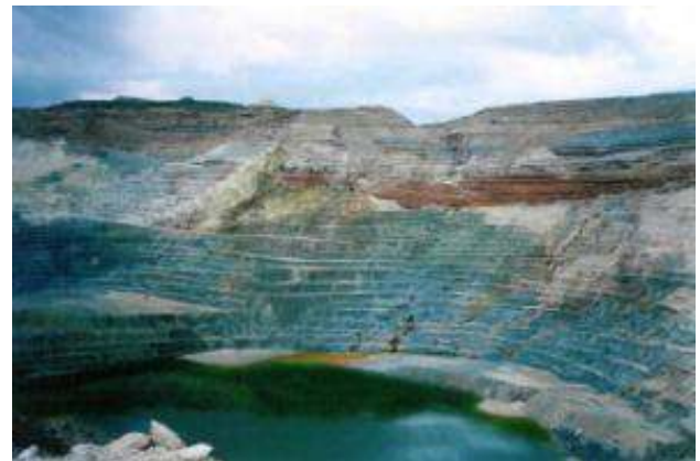
Landslide area after the rehabilitation