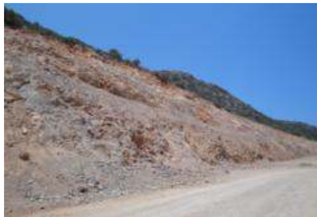
Cut's general view