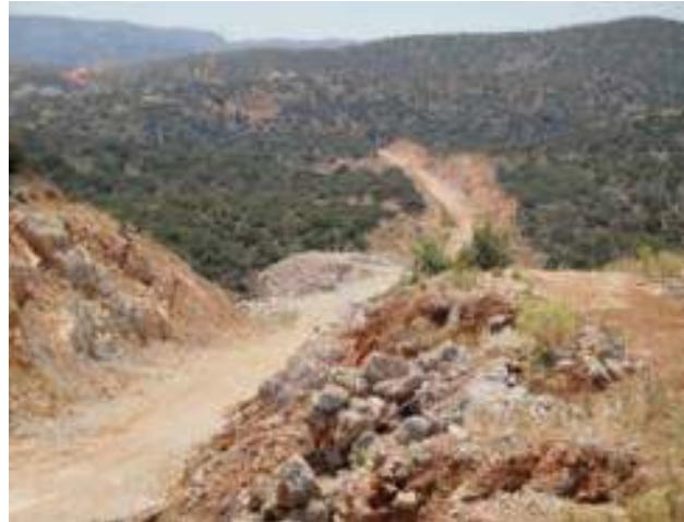
Cuts – embankments general view